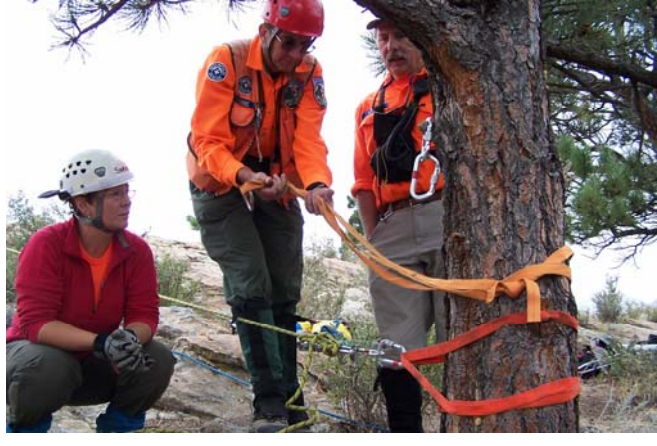
©LCSTAR Newsletter Summer 2003 www. larimercountysar.org 2003 Larimer County Search and Rescue, Inc. 1303 N. Shields, Ft. Collins, CO 80524